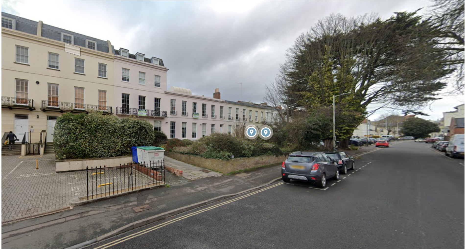
Street view image