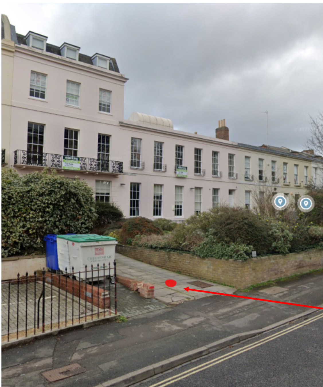
Location of proposed bollard